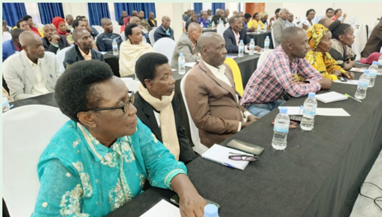
Members of the Ingabo Farmers' Syndicate during the Annual Statutory Congress Meeting

On May 7, 2025, the Annual Statutory Congress Meeting of the Ingabo Farmers' Syndicate was successfully held at the Lucerna Hotel in Muhanga District, Southern Province.