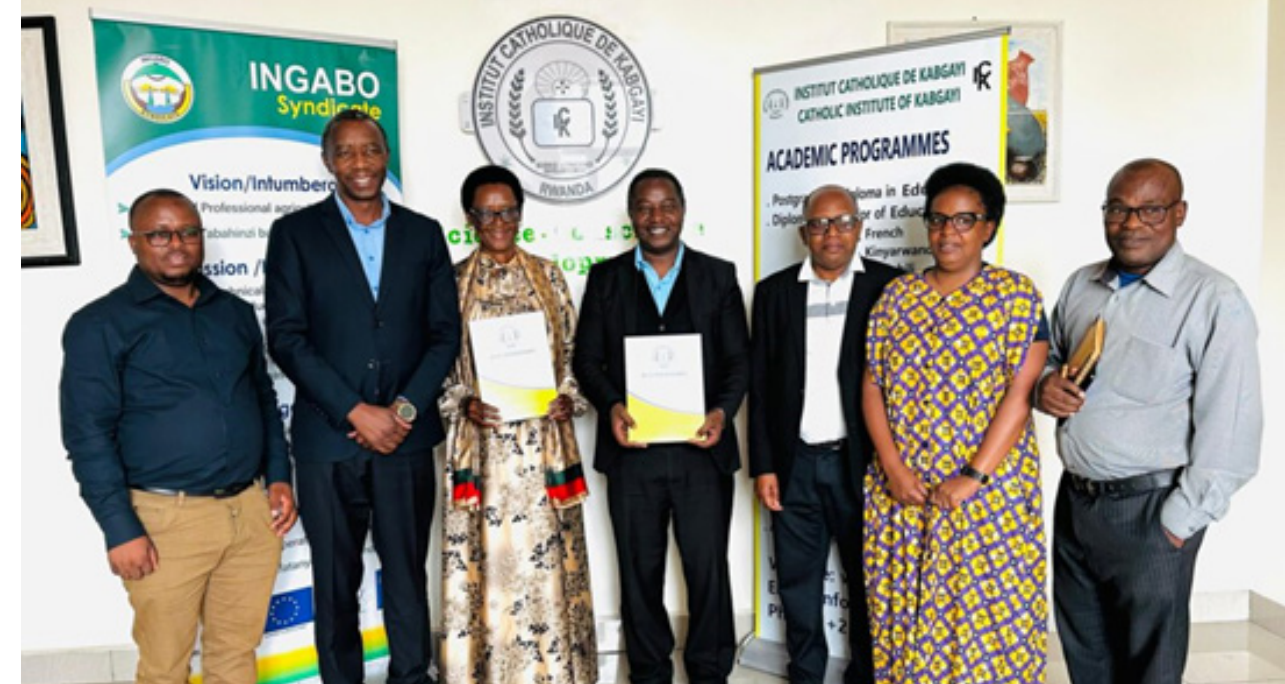
Leaders of the Institut Catholique de Kabgayi and the Ingabo Farmers' Syndicate pose for a group photo after signing the MoU