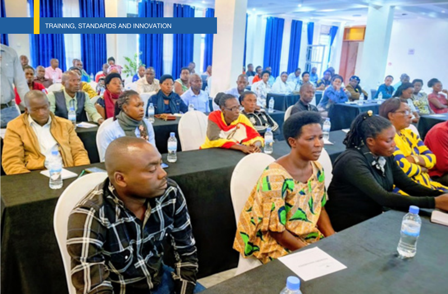
Farmer Field School facilitators during a training on Good Agricultural Practices (GAP)