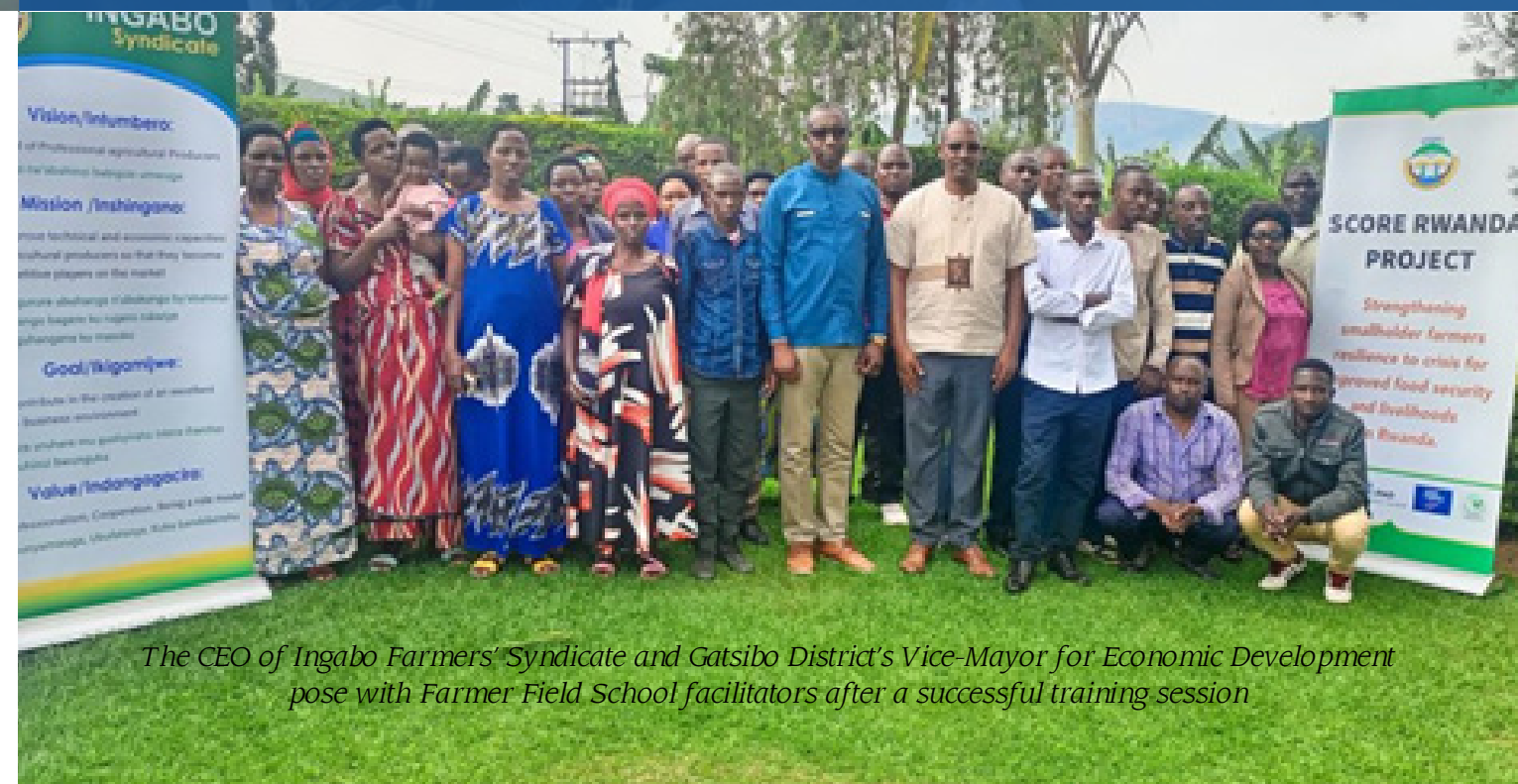
The CEO of Ingabo Farmers' Syndicate and Gatsibo District's Vice-Mayor for Economic Development pose with Farmer Field School facilitators after a successful training session

The training reaffirmed the commitment of GAFSP and IFAD to empowering rural communities through knowledge, innovation, and sustainable development.