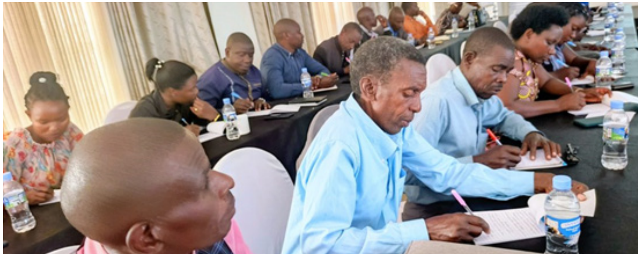
Cassava seed multipliers attending a hands-on training at Lucerna Hotel, Muhanga District.

From November 19-21, 2025, cassava seed multipliers from all ten Districts under the SCORE Rwanda Project gathered at Lucerna Hotel in Muhanga District for a dynamic two-day training focused on improving both the quality and quantity of cassava seed production.