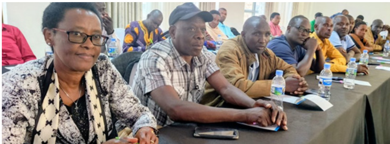
Cassava seed multipliers attending a hands-on training at Lucerna Hotel, Muhanga District.